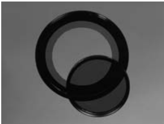
Polarizers (LP-PLZ, 700009730000)