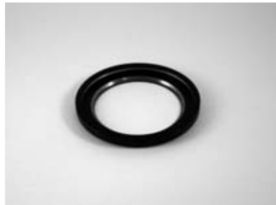
Dark Field Reflector (LP-DFR, 010090460000)