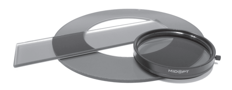
*G = Glass; L = Laminate; Circular Polarizing Sheets available in Left and Right-handed options