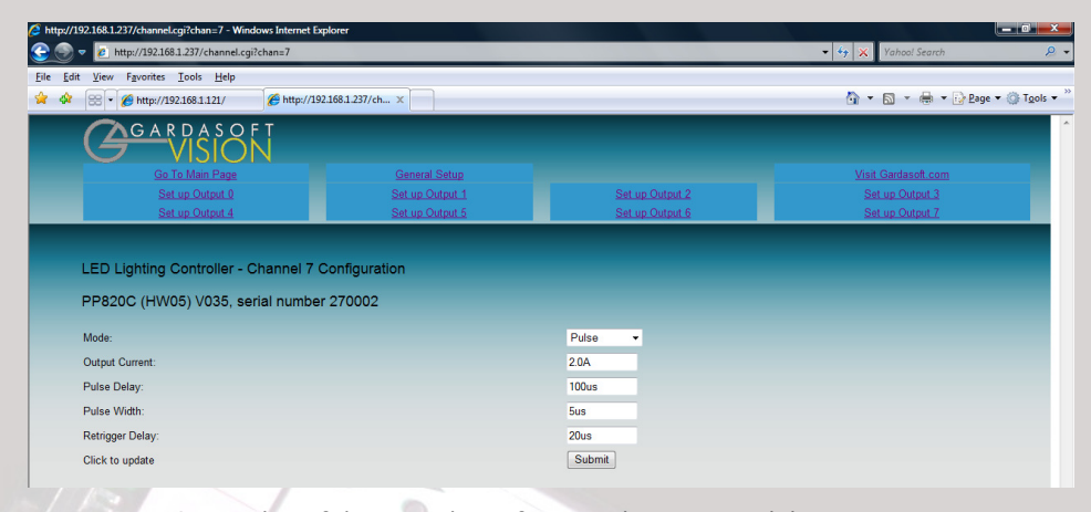
Screenshot of the control interface simply using a web browser

The PP820 acts as a miniature web server and can be controlled by image processing software on a remote PC.