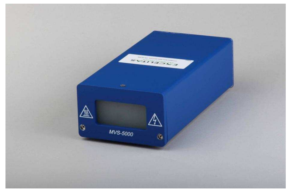
The MVS-5000™ Machine Vision strobe from Excelitas is ideal for a variety of applications including quality assurance and motion detection.