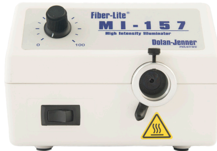
Mi-157 Manual Iris for Precise Color Control