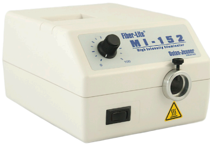
Mi-152 25mm Fiber Interface Accepts all DJ Fibers & Adapters